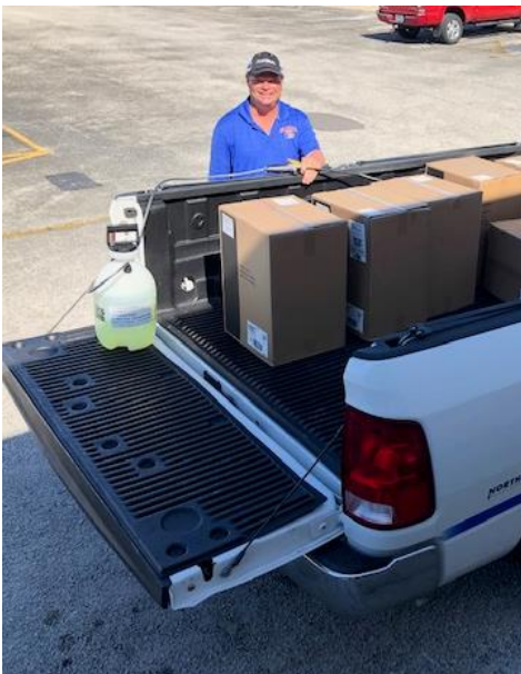
BPS Parcel Receiving Sites (i.e. Warehouse, Satellite-receiving Sites, & ESF Mail Room) are provided with bulk disinfectant products.