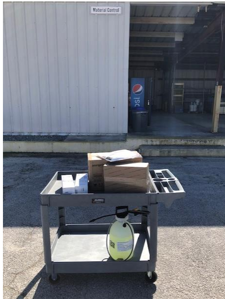
Place/rotate packages in direct sunlight if/where applicable. BPS standard products kill Human Coronavirus .