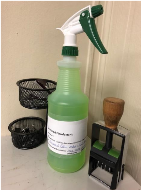
Site-based Custodian can create disinfectant spray w/standard germicidal Products for individual school offices.

Consider the following as extra precautionary methods to prevent the spread of germs (including Human Coronavirus ) by handing carrier/mail packages and envelopes: