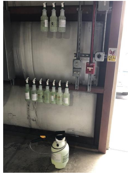
BPS Carrier-driver Staff have individual disinfectant spray dispensers/product.