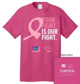
Breast Cancer Survivor Tee W2086 New Item 100 Points