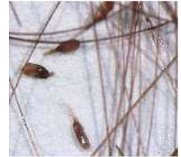
Nits (lice eggs) photo courtesy of the University of Florida.

Female head lice glue their grayish-white to brown eggs (nits) securely to hair shafts. The eggs are resistant to pesticides, and they are difficult to remove without a special 'nit-comb.' The nits are generally near the scalp, but they may be found anywhere on the hair shaft.