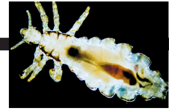
Head louse Pediculus capitis

Do not panic! Head lice are not an emergency and, in most cases, do not pose any health risk. However, misuse of pesticides and use of unlabeled treatments (ex., kerosene) can pose a health risk.