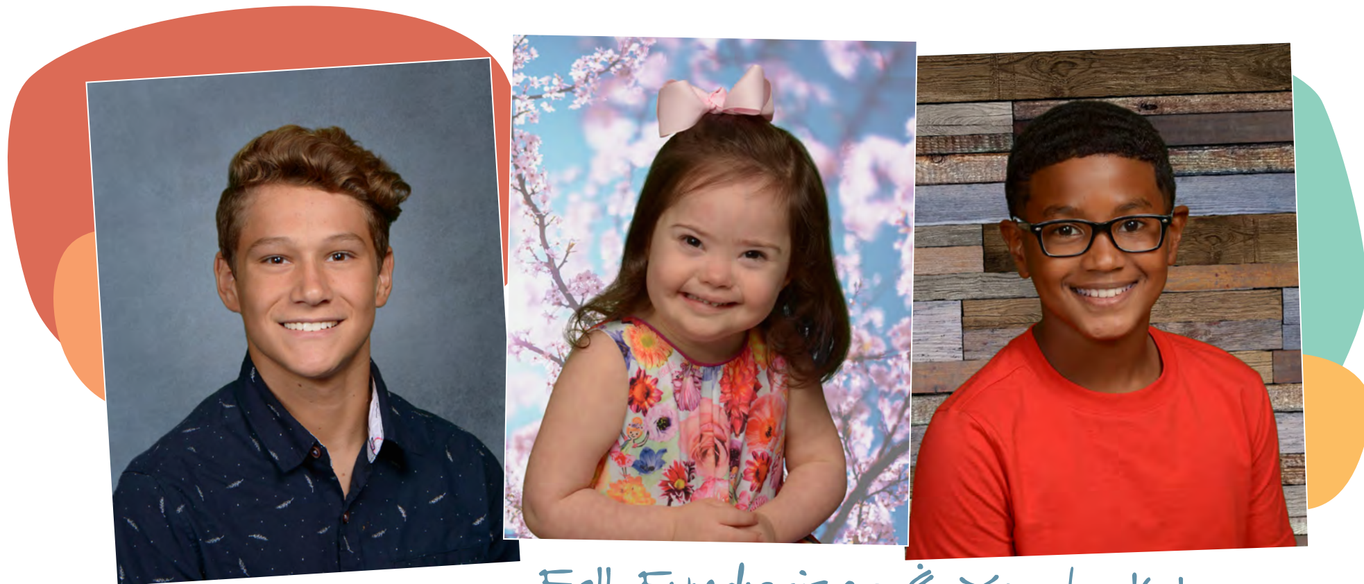
Fall Fundraiser & Yearbook Images