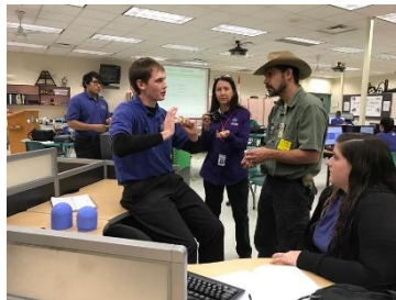
National recognition, KSC and Johnson Space Center Engineers work with HUNCH students, High schools United with NASA to Create Hardware