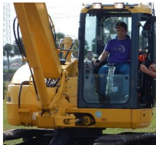
Students explore real-world applications at Sky Zone; below a student drives construction equipment at FLDOT event!