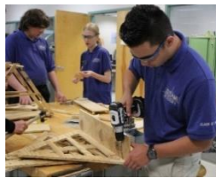
Students create Trebuchets; below they draft projects.

STEAM provides a learning environment which stresses the development of strong character personally and ethical behavior professionally delivered in a supportive learning structure.