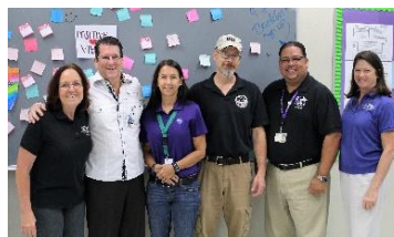
Partnerships with area manufacturing company Knight Armament, and NASA HUNCH engineers for the ISS!